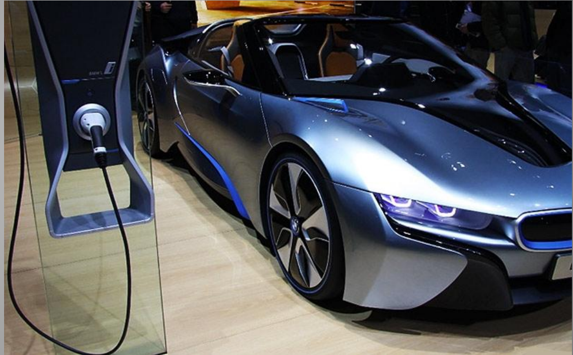
The first luxury completely electric car.

-the electricity used is still produced with non-renewable resources.